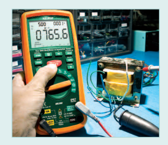
Measure the insulation resistance of transformer windings