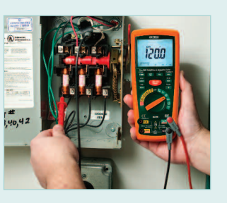
Only a True RMS meter can give accurate readings of distorted waveforms