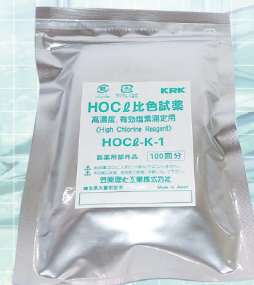
HOCℓ-K-1 Reagent for high density Chlorine Measurement