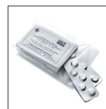
A00000136 Control Test tablets