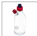
A00000410 Denitrification glass bottle