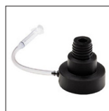
A00000135 Sensor check