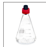
A00000418 Kit Soil Analysis