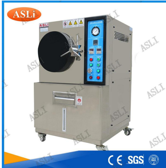
HAST accelerated aging chamber