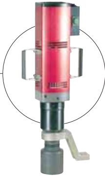
EFW Series Right Angle Mul tiplier