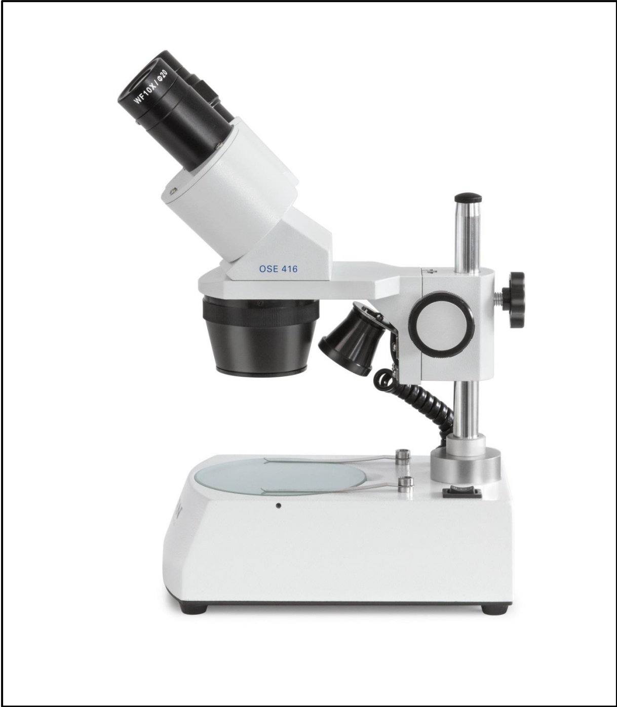
Assembled stereo microscope