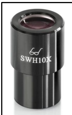
High Eye Point eyepiece (identified by the glasses symbol)