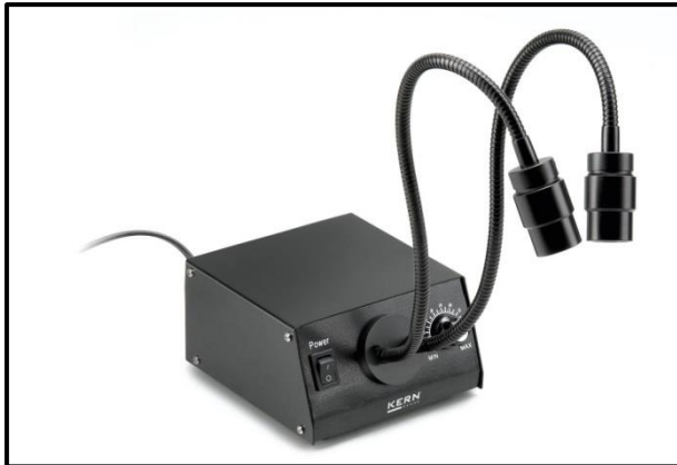
Typical goose neck lighting unit

The lighting units which are suitable for devices of the OSE-4 series, are goose neck lighting units ( see figure ). These are available as LED as well as halogen versions and also have an on/off switch or different controller.