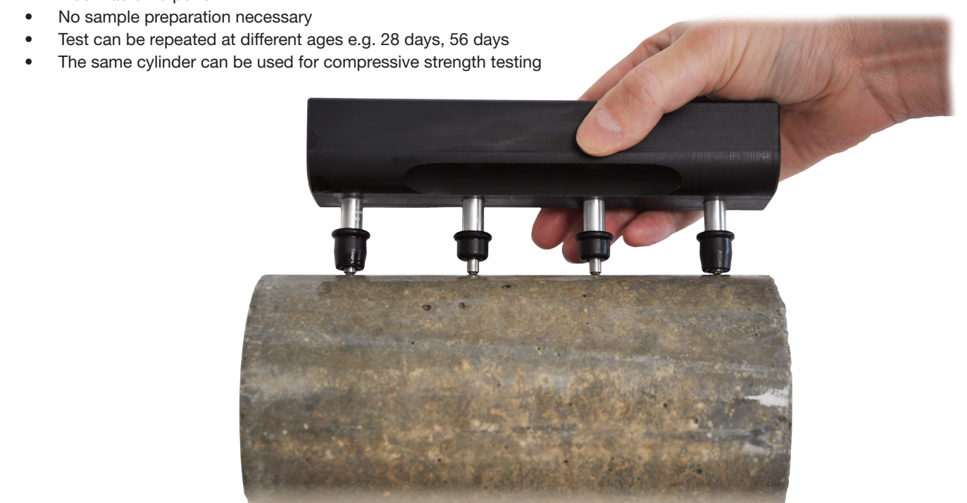
Resipod with 1.5" (38mm) probe spacing is fully compliant with the above mentioned standard