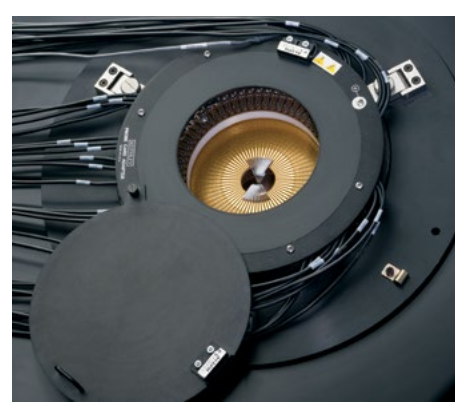
The Model 9139A Probe Card Adapter has been trusted by the industry for more than 10 years. Its combination of low current performance and high voltage capability makes it the ideal companion to the S530 Parametric Test Systems.