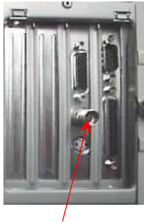
Composite Video Connection

The other end of the composite video cable should be connected to the composite video input on the video capture card on the PC. See Figure 2. The power cord should be connected to a properly grounded 120 VAC power supply.