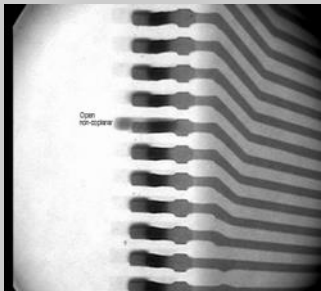
Leaded Component Non-Co planarity