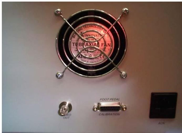
Figure 1: The back of the XR 3500/3700

Locate the foot pedal, composite video cable, and power cord. These should be connected as shown in Figure 1.