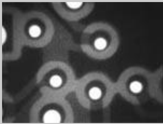
Bare Board Hole/Pad Offset