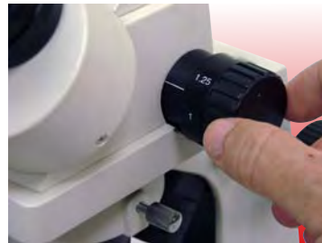
Zoom adjustable magnification knob