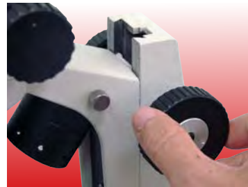
Adjustable focus knob