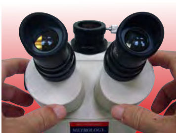
Dual eyepiece & CCD port