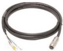
Cable Included SH-Motor Cable (3m) Item: #14-518-0037