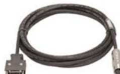
Cable Included SH-Encoder Cable (3m) Item: #14-518-0034