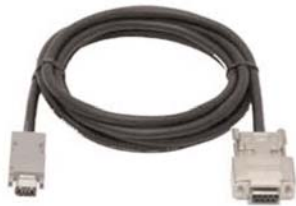
Optional Accessory RS-232C Item: # 145953

SHC-50 & SHC-100: (WxLxH): 2" x 6 1/8" x 6" SHC-400: (WxLxH): 2 1/4" x 6 1/8" x 6" SHC-800: (WxLxH): 3 1/8" x 6 1/8" x 7 7/8"