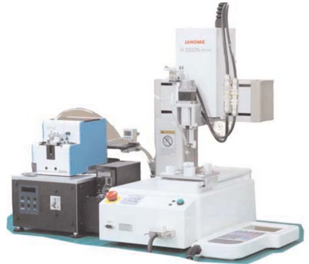
A robotic screw presenter used in conjunction with SH robotic torque control system.