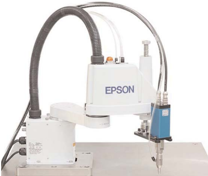
SH driver mounted to an automation system.