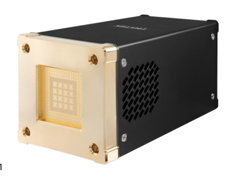
Figure 1. BBox™ One 5G 28 GHz