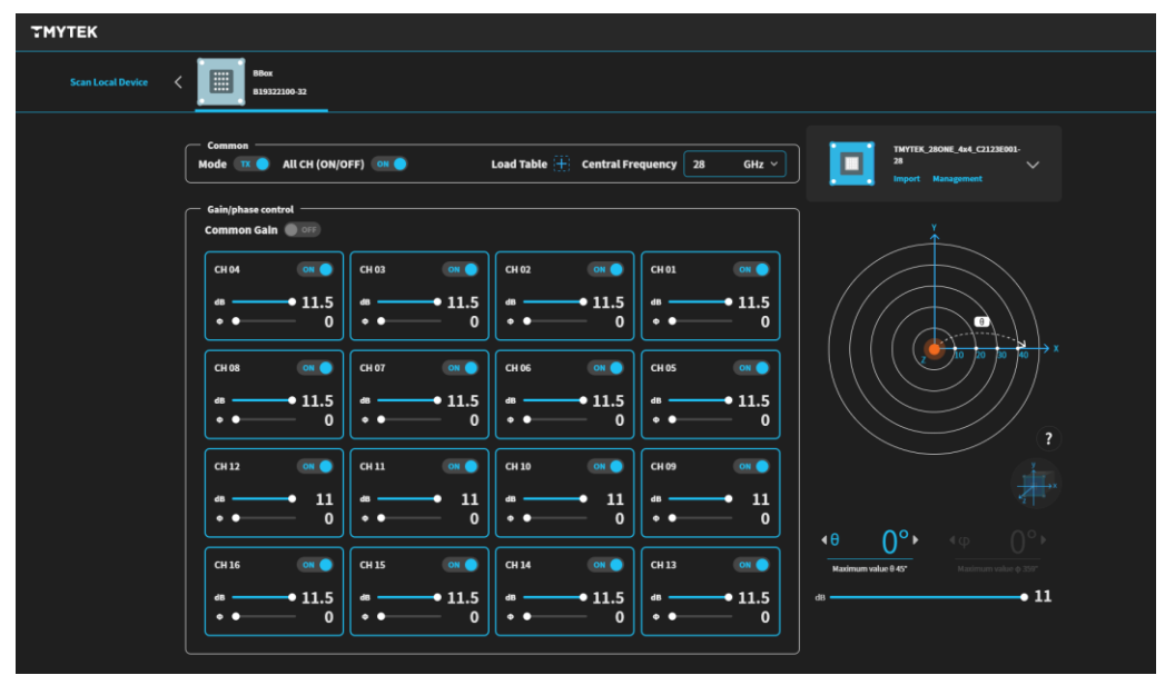
Figure 3. TMXLAB Kit - Software GUI for controlling BBox™ One

The BBox ^{\text{\tiny{IM}}} One software interface offers both UI and API control which are completely designed in house by our software team. Our patented software algorithm offers better accuracy and easier control on the beam angles. The module can be controlled either by RJ-45 ethernet cable or USB cable. Both the UI and API are available for our customers to access and download from the Web. The user interface shows the 16-channel phase and amplitude control block diagram as depicted below. To control the parameters, please drag the dB and \Phi slide bars on the desired channel to make the changes. The left portion of the interface shows the beam steering angle. This can be used together with our standard antenna kit to control the steering angle.