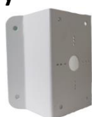
DS-1276ZJ-Y Wall Mount