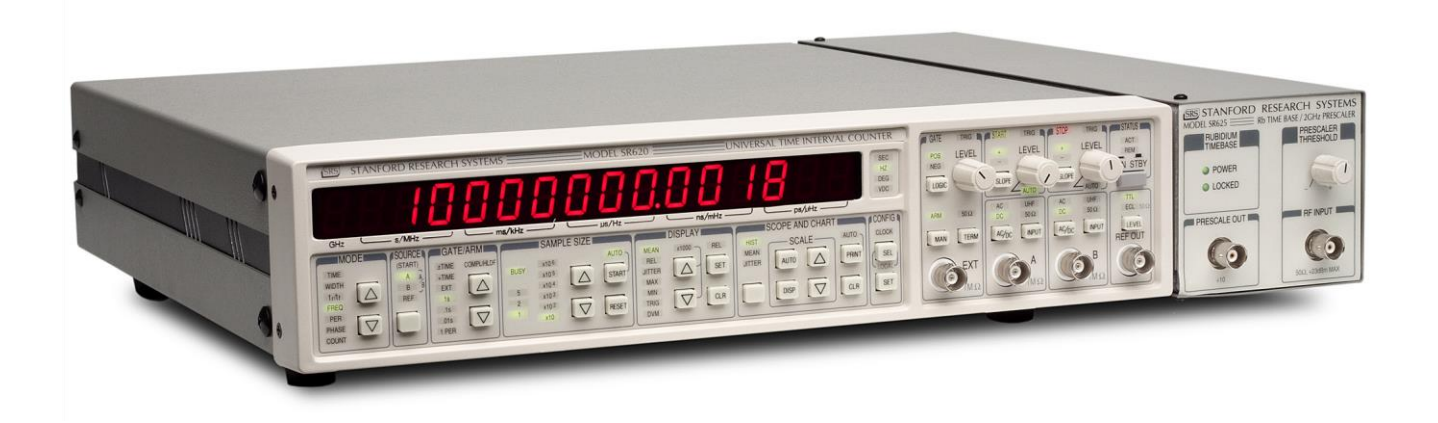
SR625 — Frequency counter with rubidium timebase