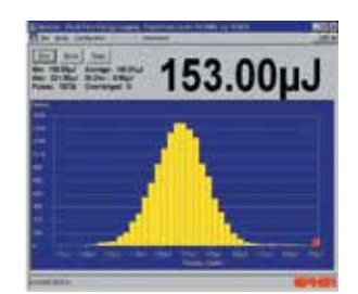
LabVIEW StarCom Software