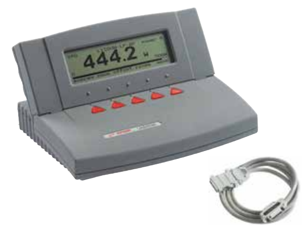
IEEE 488 GPIB Cable for

The LaserStar's dual channel capabilities enable the user to simply plug in any of Ophir's thermal, pyroelectric or photodiode sensors and measure the two channels independently, or a comparison between the two channels.