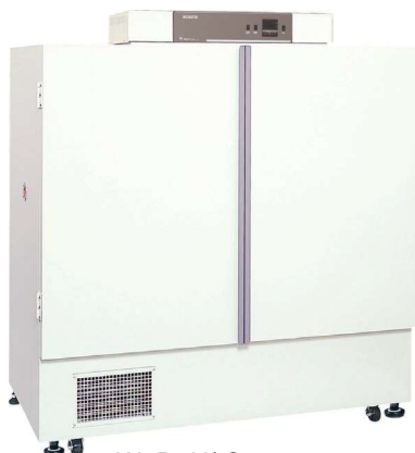
Inner dim. W×D×H/ Cap ILD-150/150C