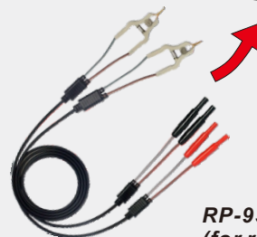
RP-93 (for resistance test)