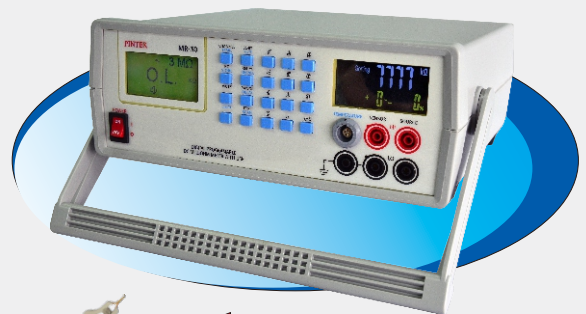
MR-30 DC Milliohm Meter