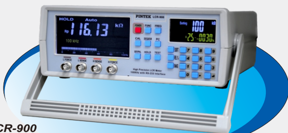
LCR-900 High Precision LCR Meter