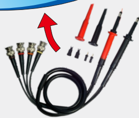
RP-92 (for SMT type parts)