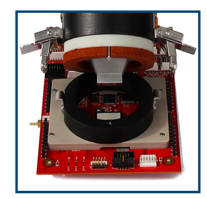
DUT Interfacing: Test Socket Alignment - latches and guide pins provide easy and secure connections to the test socket. Soldered Component Alignment - customized interfaces to accommodate PCB layout and chip geometry.