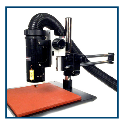
Boom Stand: The Boom Stand provides X, Y, Z positioning of the Thermal Head over the DUT. (P/N SA214350)