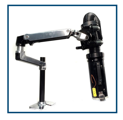
Bench Stand: Free-motion stand and boom provide manually positioning of the Thermal Head over the DUT. (P/N SA214360)