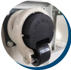
Strong Casters with Brake

The strong casters with brakes makes moving or fixing the refrigerator even easier.