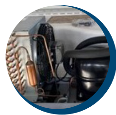
North Sciences Design Refrigeration Block

Triple coated tempered glass with heat reflective film, ensure the inner temperature and anti-condensation.