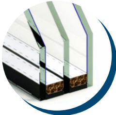
Triple Coated Tempered Glass

The strong casters with brakes makes moving or fixing the refrigerator even easier.