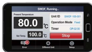
WiRe™ App & Web Service

It is possible to monitor and control the Smart-Lab™ equipment through all smart phone, tablet and web without restraint of time and place.