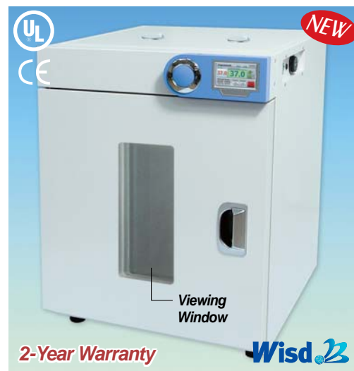
Oven, Forced Convection-type, Built in Viewing Window Model, with Wire Shelves "SWOF-W155"