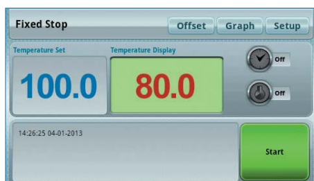
4" Full Touch Screen TFT LCD (Smart-Lab™ Controller)

It is possible to monitor and control the Smart-Lab™ equipment through all smart phone, tablet and web without restraint of time and place.