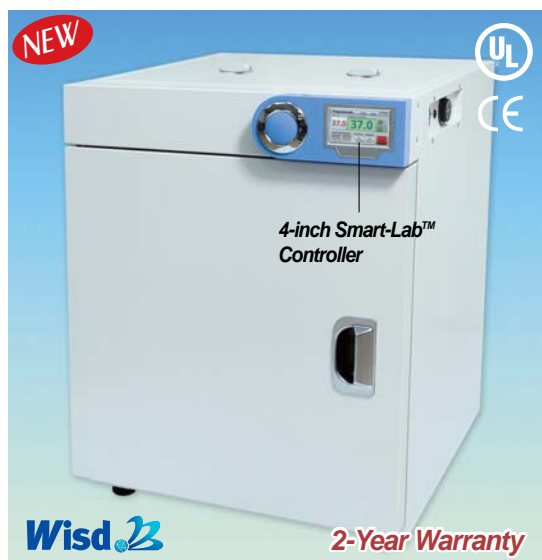
Oven, Forced Convection-type, Standard Model, with Wire Shelves “SWOF-155”

DAIHAN® Ovens, Forced Convection-type, “SWOF”, 50-/105-/155-/305 Lit., with Certi. & Traceability NEW with Smart-Lab™ Controller, 4" Full Touch Screen, Fuzzy-PID Control, up to 250°C, ±0.3°C