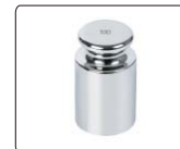
calibration weight (included in 8310-120M, 8310-210M and 8310-320M)