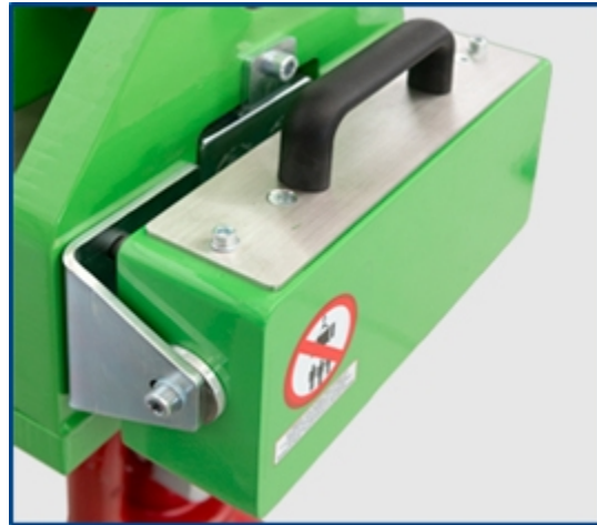
Fitted with extractable rechargeable battery pack.