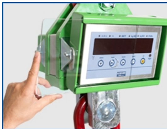
Protective screen in plexiglas for display and keyboard.