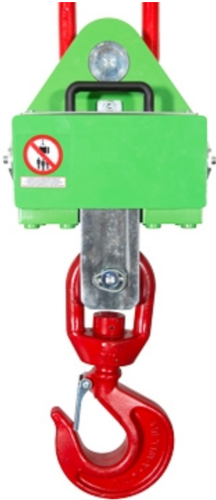
MCWHU: view of the back.