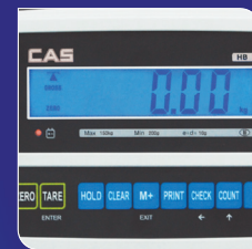
Blue backlight LCD