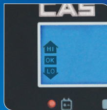
Check-Weighing Function (HI/OK/LO)