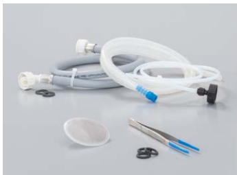
Tweezers · Sieve · Maintenance hose · Rinsing set · Tank cap

Further accessories and optional unit functions: