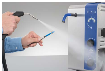
Cleaning with flexible handpiece Parts can be held securely (also with tweezers) and sprayed all-round quickly and effectively.