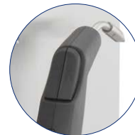
Compressed air (optional function)