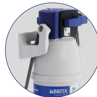
Water filter cartridge Brita purity C150 Quell ST