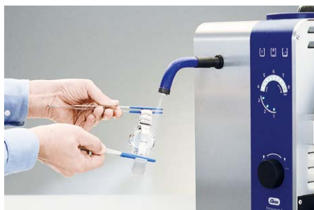
Cleaning with fixed nozzle and foot pedal Ideal for working with both hands or for larger workpieces.