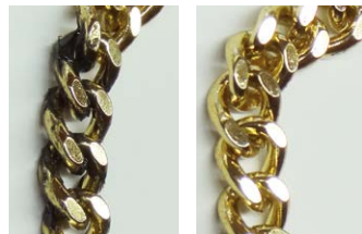
Removal of polishing paste