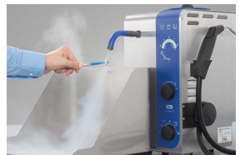
Cleaning in the evaporating dish Moisture and dirt are absorbed and can be easily disposed.