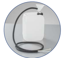
Canister with filling level meter

*3 years warranty for proper use in accordance with the operating manual. Wear parts are not covered by the warranty.