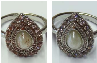
Removal of dirt arising from wearing