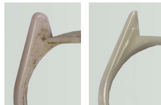
Removal of polishing paste