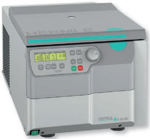
Refrigerated High Sped Centrifuge Z 32 HK

Max. speed 20,000 rpm Max. volume 4 x 145 ml