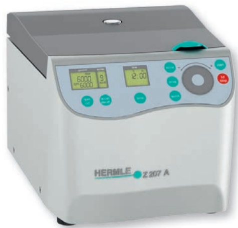
Compact Centrifuge Z 207 A

Max. speed 20,000 rpm Max. volume 4 x 145 ml