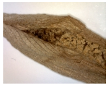
More field of view