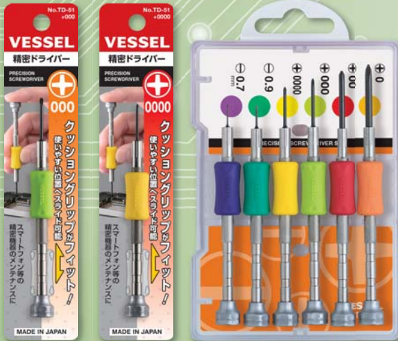
TD-51 +000 TD-51 +0000