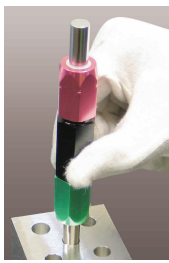
Pin Vise Compatibility Table