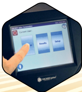
Intuitive Color Touchscreen