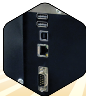
Multiple Back USB Ports