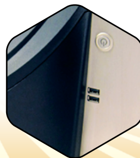
Easy-to-Access Front USB Ports