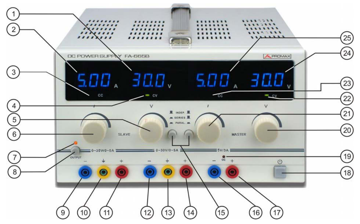
Figure 1. Front panel description.