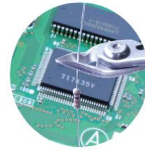
SSN-125 Stainless Cutting Pliers Slender-type