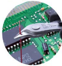
SCN-125/140 Stainless Cutting Pliers (125mm/140mm)