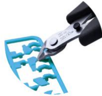
SPN-125 Stainless Cutting Pliers for Plastics

Stainless Pliers with Lock Spring Series : 6 type 7 items are available.