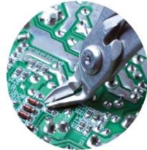
SNB-125 Stainless Cutting Pliers Bent-type