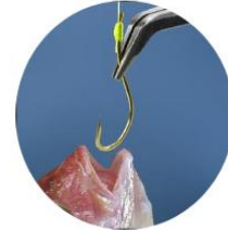
SPB-140 Bent Nose Lead Pliers