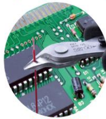
SCN-125/140 Stainless Cutting Pliers (125mm/140mm)