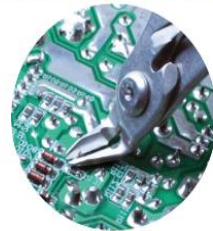
SNB-125 Stainless Cutting Pliers Bent-type