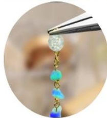
SCP-140 Fine Nose Lead Pliers