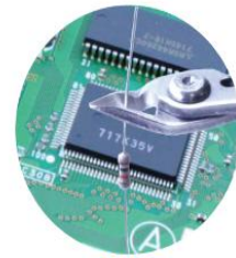
SSN-125 Stainless Cutting Pliers Slender-type