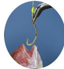
SPB-140 Bent Nose Lead Pliers