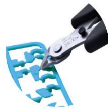
SPN-125 Stainless Cutting Pliers for Plastics

Stainless Pliers with Lock Spring Series : 6 type 7 items are available.