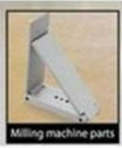
Milling machine parts