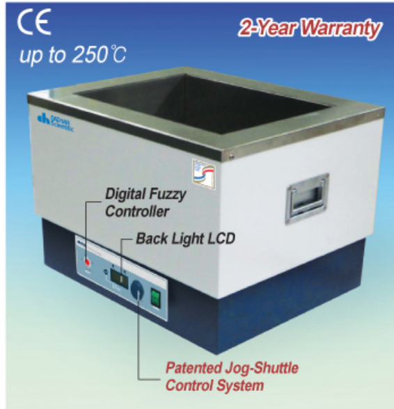
Digital High Temperature Oil Bath, 11Lit, “WHB-11”

DAIHAN® Digital High Temperature Oil Bath “WHB”, Digital Fuzzy Control System, 6· 11· 22 Lit, up to 250°C, ± 1.5°C With Stainless-steel Flat Lid, Back Light LCD, with Certi. & Traceability, 정밀 고온 오일 배스, 디지털 퍼지 제어 시스템, 스텐리스 스틸 리드 포함