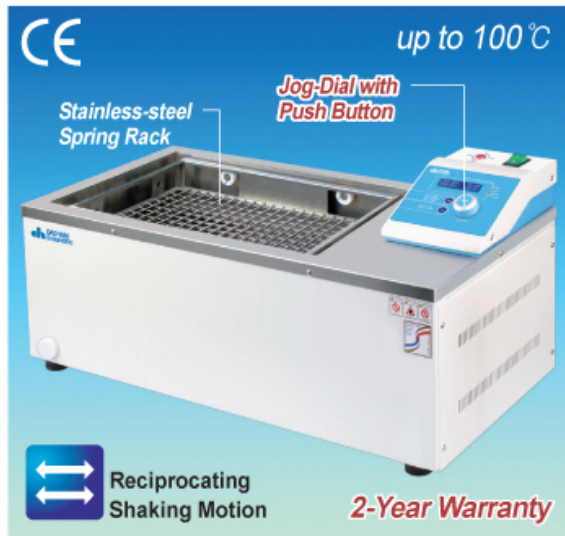
Digital Precise Shaking Water Bath Max. 30Lit, "MaXturdy™ 30"

DAIHAN® Digital Precise Shaking Water Bath "MaXturdy™", Reciprocating Motion, 18 · 30 · 45 Lit With Universal Spring Rack, Digital Fuzzy Control, up to 2 Lit Flask, 20~250 rpm, up to 100℃, ±0.1℃, with Certi. & Traceability 정밀 진탕 항온수조, 왕복 진탕 운동, 디지털 피드백 제어, 고성능 셰이킹 엔진 탑재