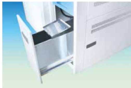
Auto Water Supplementing System