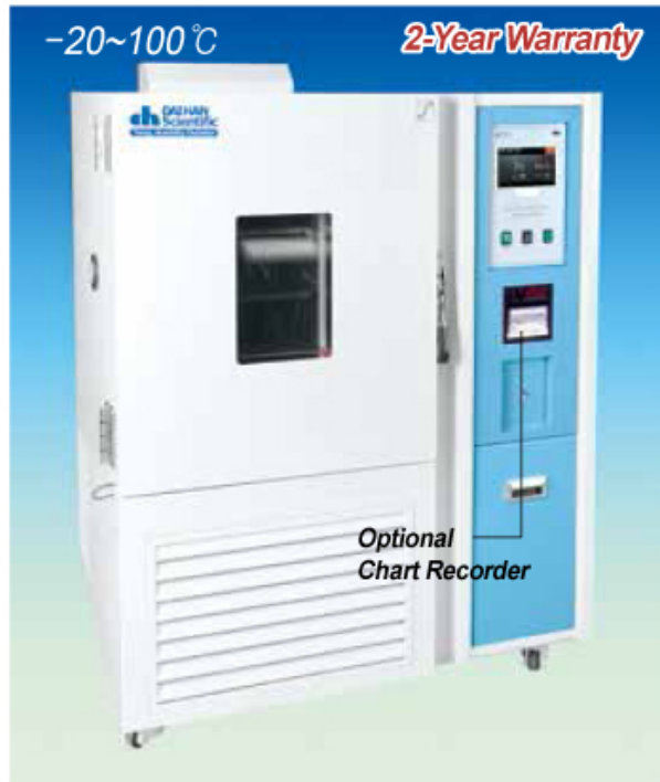
SMART Precise Temp. / Humidity Chamber "ThermoStable™ STH-155"