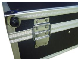
Reinforce Construction Hinges and Corner Protector