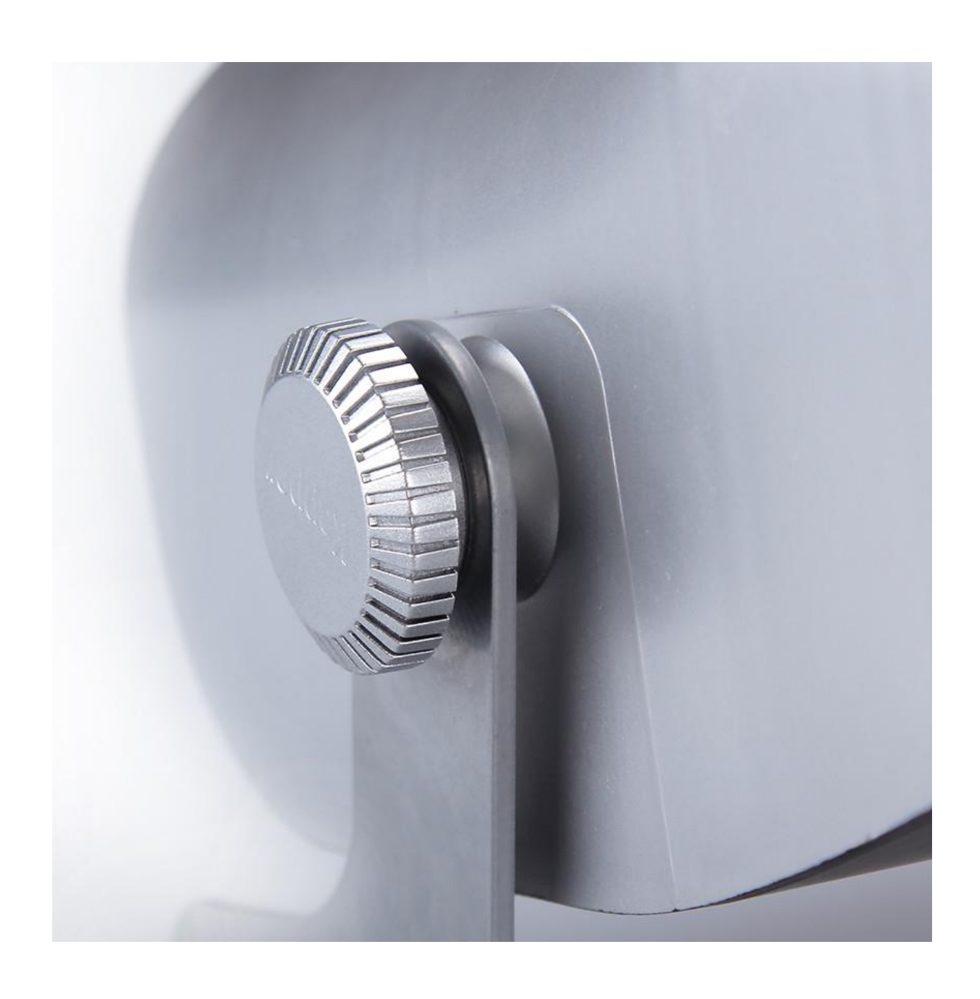
Cross flow ionizing air blower static remover with hot and cold air by remote control