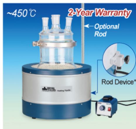
(1) Plain Bottom-type Remotecontrolled Reaction Vessel Heating Mantle