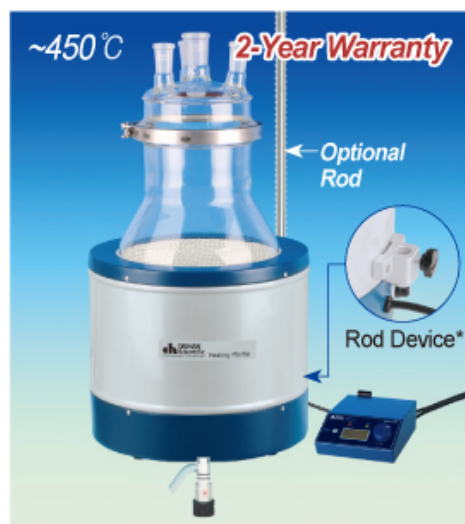
(2) Bottom Outlet-type Remotecontrolled Reaction Vessel Heating Mantle