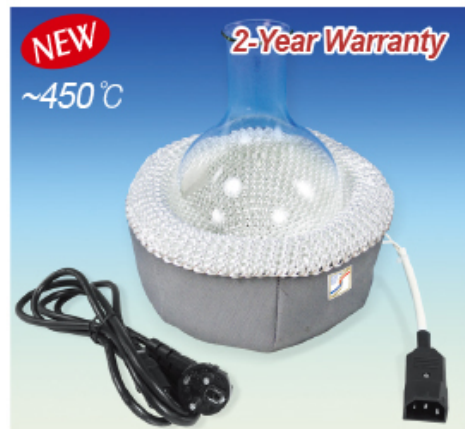
(1) Self Standing-base