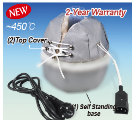
<Ex.>(2) Top Cover with (1) Self Standing-base