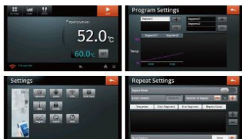
4" Full Touch Screen TFT LCD (Smart-Lab™ Controller)

It is possible to monitor and control the Smart-Lab™ equipment through all smart-phone, tablet without restraint of time and place.