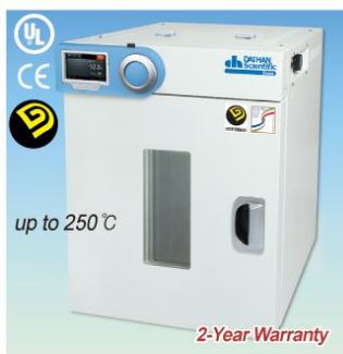
(2) SMART-Window Model, Forced-air Oven