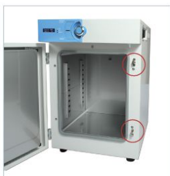
Perfect Door Lock by Double Latch

3-Side Heating Zone Forced-air Mechanism : The Best Temp. Uniformity & Accuracy by High Performance Heating Mechanism (Exclude SOF-305, SOF-W305)