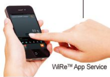
WiRe™ App Service

It is possible to monitor and control the Smart-Lab™ equipment through all smart-phone, tablet without restraint of time and place.