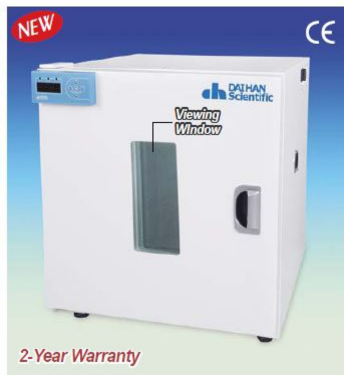
(1) "ThermoStable EOF-155" Eco-type Forced-air Oven, Standard Model