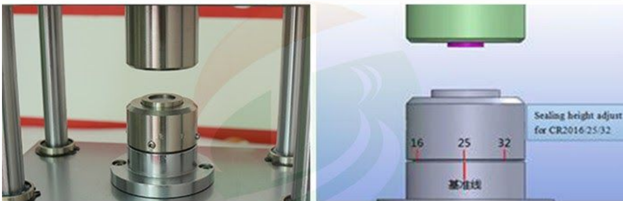
Sealing height adjusted for CR2016, 2015, 2032 coin cell