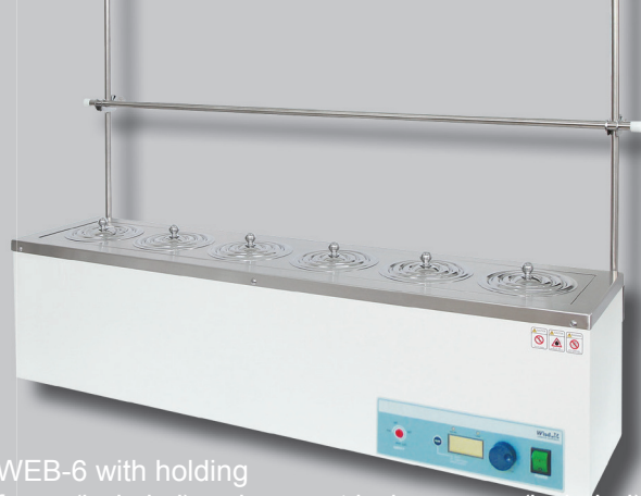
WEB-6 with holding frame (included) and concentric ring covers (included)