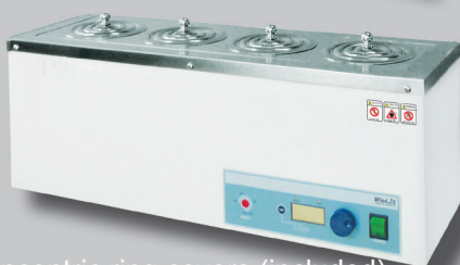
WEB-4 with concentric ring covers (included)