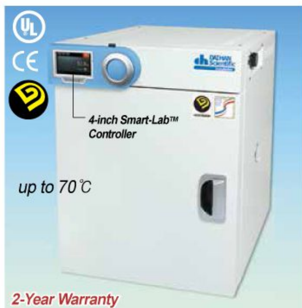
"ThermoStable™ SIF-105", SMART Forced-air Incubator

DAIHAN® SMART Forced-air Incubator "ThermoStable™ SIF", 50 · 105 · 155 Lit, 3-Side Heating Zone With Smart-Lab™ Controller, 4" Full Touch Screen TFT LCD Display, Fuzzy-PID Control, 2 Wire Shelf, Certi. & Traceability, up to 70°C, ±0.2°C 스마트 강제 순환식 배양기/인큐베이터, 우수한 온도균일성, WiRe™ 서비스, 4인치 풀터치스크린 조절기