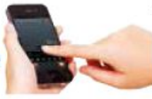
4" Full Touch Screen TFT LCD (Smart-Lab™ Controller)

It is possible to monitor and control the Smart-Lab™ equipment through all smart phone, tablet without restraint of time and place.