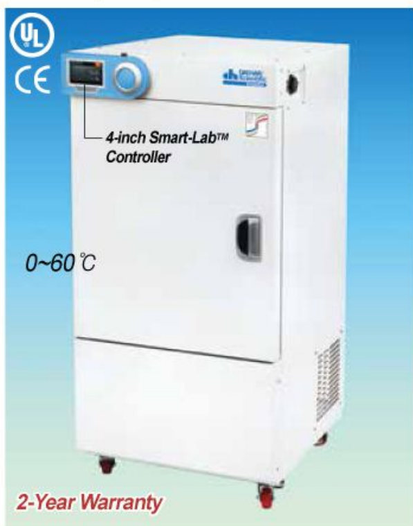
SMART Low Temperature(B.O.D) Incubator "ThermoStable™ SIR-150"