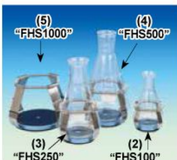
STS Flask Holder w/Spring Ring (Optional)