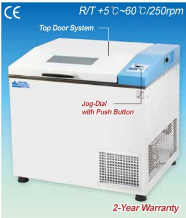
A. Room Temp. +5°C~60°C, With Universal Platform "ThermoStable™ IS-10"

DAIHAN® Precise Shaking Incubator "ThermoStable™ IS-10", Top Door-type, Orbital Motion, up to 60°C, ±0.2°C With Universal Platform, Fuzzy Control, with or without illuminators & Recorder, 30~250 rpm, with Certi. & Traceability 진탕 배양기/인큐베이터, 탑 도어 타입, 고정밀 디지털 퍼지 제어, Universal Platform 포함