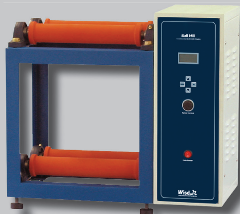
BML-2 with up to 2 places

with 2 or 6 places, 50 - 600 rpm, programmable, soundproof cabinet optional