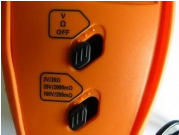
Battery tester operation button