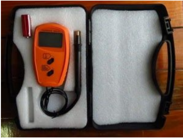
Test polymer battery