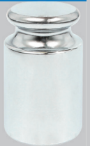
2 kg (WBA-3200) calibration weight included